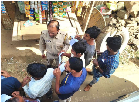
A policeman checking ILPS permit to non-local at NH-2 in Senapati District

May be it was a coincident, eye witness accounts in between Mao to Kangpokpi along the National Highway 2 show N. Biren Singh's government serious concern in the implementation of Inner Line Permit System regulated under the Eastern Bengal Frontier Act. In addition to this, feeling of security to travelers along this route has been felt except that the road portion is not so convenient, as many parts of High Way are under construction. The credit simply goes to the state police of both Senapati district and the Kangpokpi district.